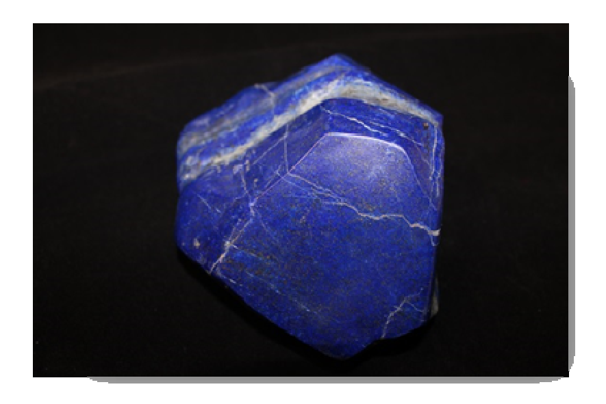
We only have a few mid-sized specimens left of the Lapis Lazuli

This month are featured mineral is Lapis Lazuli from Afghanistan. Our specimens were mined in Afghanistan's Kokcha Valley, the classic locality for lazurite and the world's premier source of lapis lazuli.